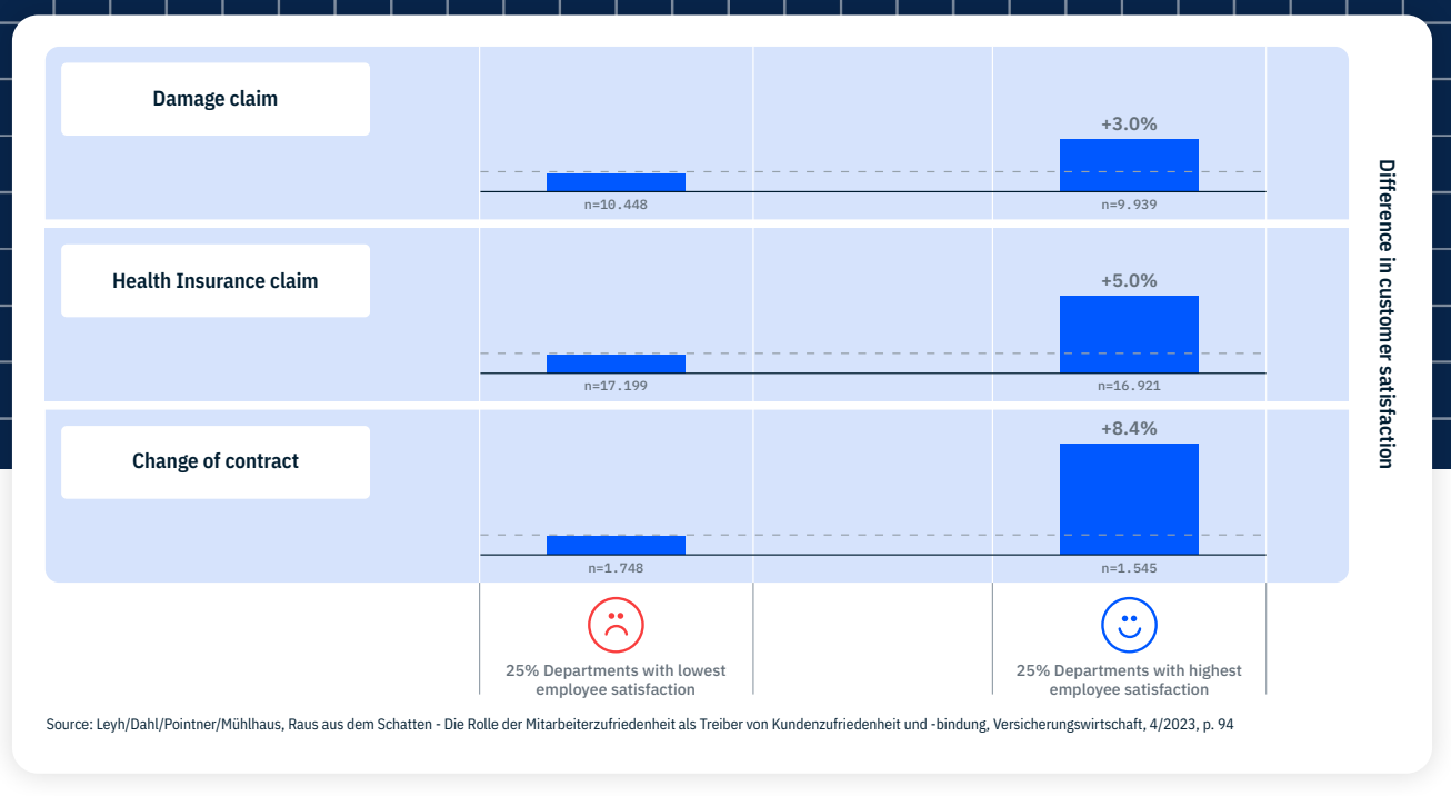
Fig. 3: Customer satisfaction differences in comparison of departments with higher versus lower employee satisfaction