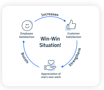
Fig. 2: Win-winsituation by linking employee and customer satisfaction

For each of the three touchpoints, there is a strong effect of employee satisfaction on customer satisfaction.